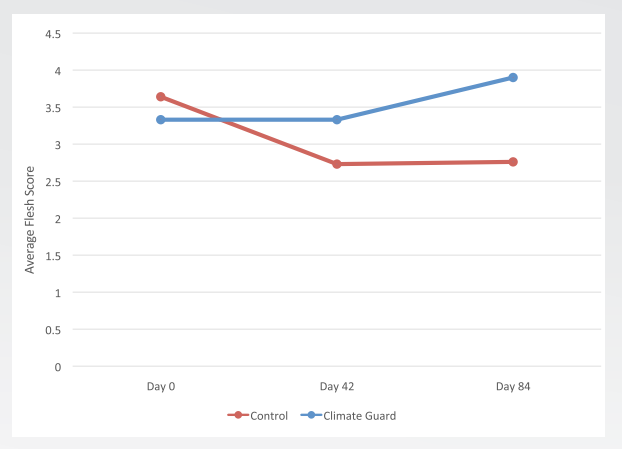
Table 2. The effect of Climate Guard^{m} supplement diet on doe rib flesh score during 84-day study.

* Research conducted by West Texas A&M University, 2016.